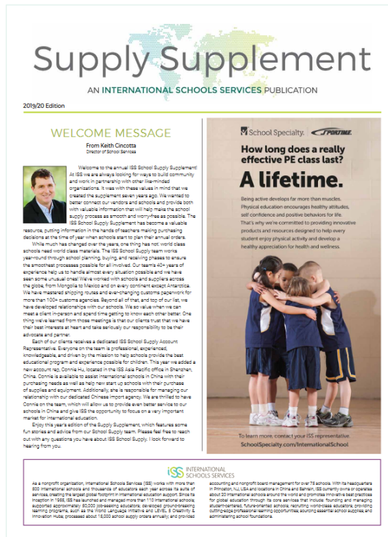
Sample digital cover page, 2019-20 edition Publication layout and design subject to change