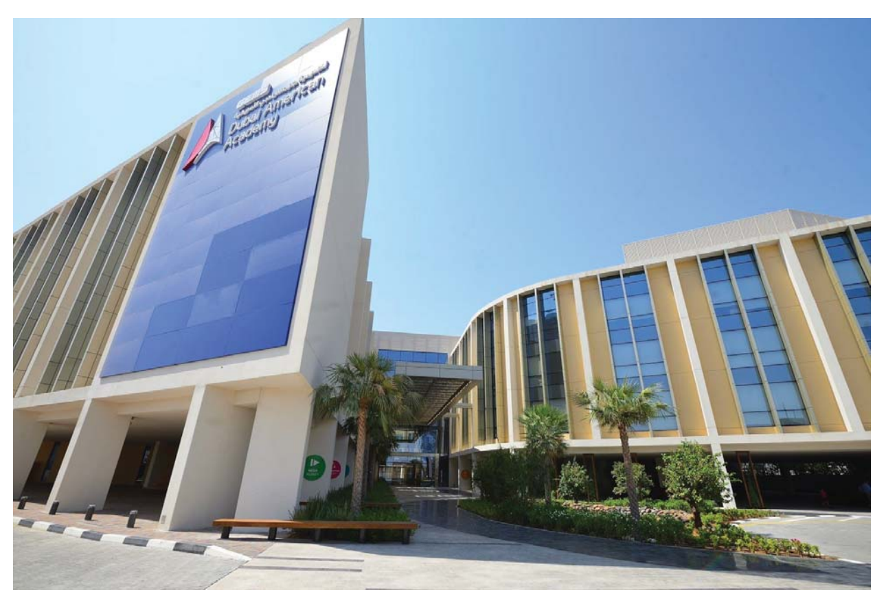
Dubai American Academy

Thank you for your interest in Dubai American Academy. We encourage you to fully explore our website, facebook, and twitter channel to discover for yourself how DAA takes our students on a journey through a world-class educational experience, empowering them to become the next generation of leaders, innovators and entrepreneurs.