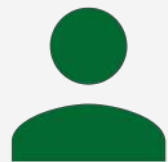
DEPUTY HEAD (9-11) IB COORDINATOR