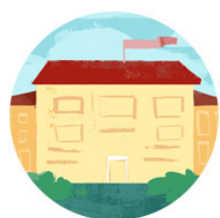
Starting and Managing Schools 学校筹办与管理

ISS每年与全球超过500所国际学校及数千名国际教育工作者合作，为学校提供因地制宜的个性化国际办学服务，是目前全球规模最大的国际学校发展及管理服务机构，足迹遍布全球。ISS现全球管理约20所声誉卓越的国际学校并致力于通过其核心服务为全球教育的创新推动提供优秀典范。服务内容包括：