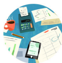
Streamlining Accounting and Finance Functions 财务基金管理