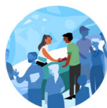
Recruiting Teachers 教师招聘