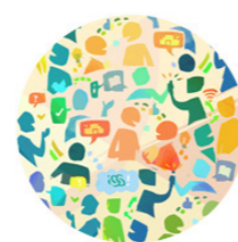
Providing Professional Development 教师专业培训