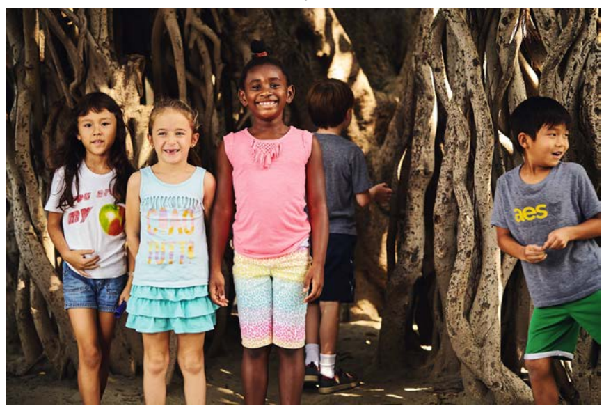
The best reason to join the AES staff...

The school reserves the right to close the selection process at any time if the right candidate is found. The review of files will begin as applications are received. Skype interviews of selected candidates will take place on a rolling basis and can be scheduled at any time after applications have been received.