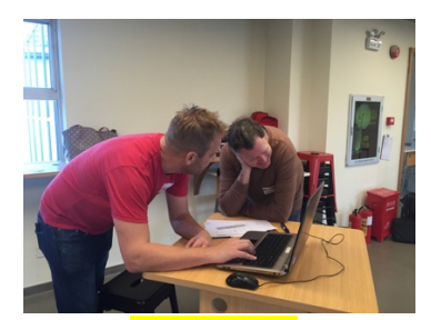
• Brain POP https://www.brainpop.com

Please help us populate this part of the RCR with your recommendations and examples. Thank you!