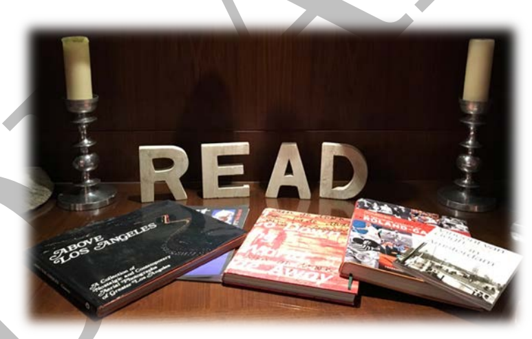
~ Draft of May 20, 2019 ~